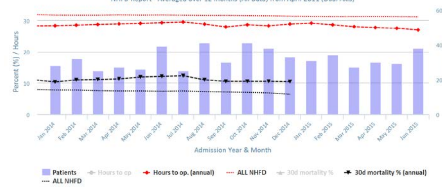
Chart data is indicative status only - www.nhfd.co.uk ® Royal College of Physicians - Technology by Crown Informatics

NHFD Report - Averaged over 12 months (All Data) from April 2011 (Dual Axis)