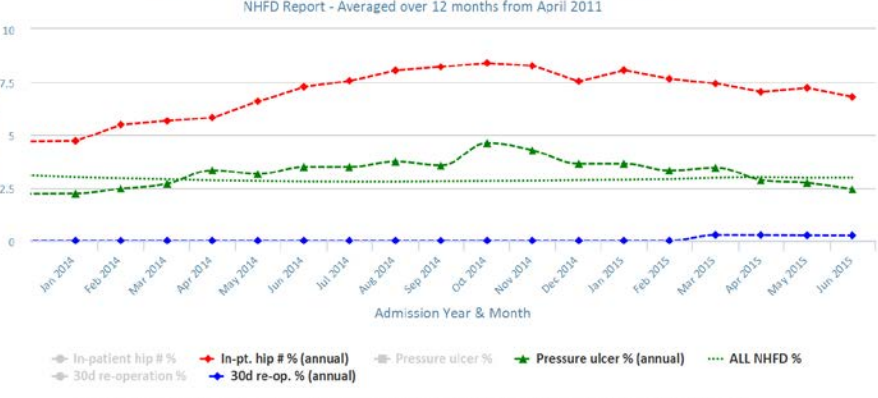
Chart data is indicative status only - www.nhfd.co.uk ® Royal College of Physicians - Technology by Crown Informatics

NHFD Report - Averaged over 12 months from April 2011