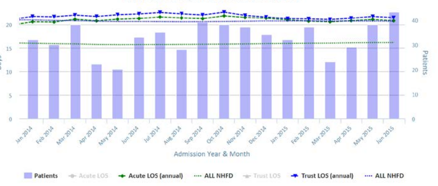
Chart data is indicative status only - www.nhfd.co.uk ® Royal College of Physicians - Technology by Crown Informatics

NHFD Report - Averaged over 12 months from April 2011