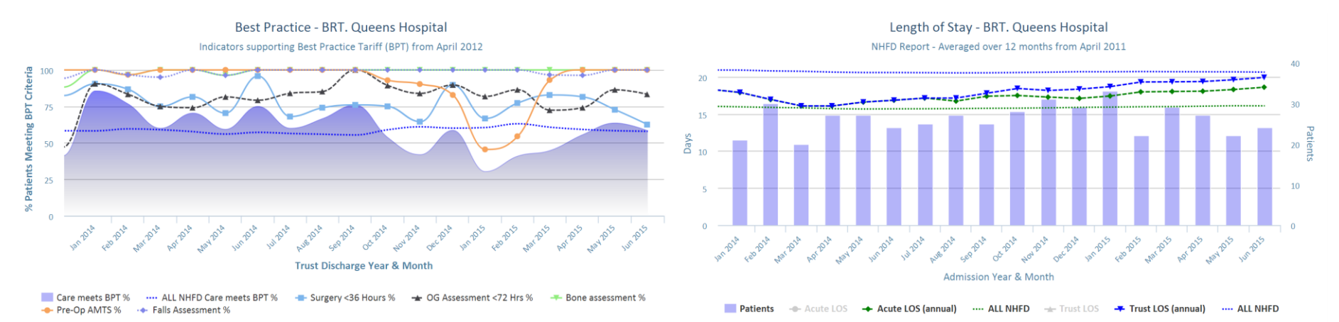
Chart data is indicative status only - © Royal College of Physicians - Technology by Crown Informatics (ID: BPT2)

(Up to date, and interactive versions of all run charts for your hospital can be viewed at www.nhfd.co.uk)