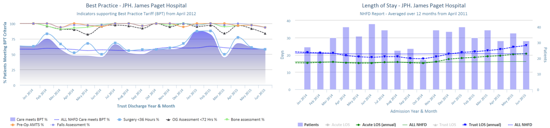
Chart data is indicative status only - © Royal College of Physicians - Technology by Crown Informatics (ID: BPT2)

(Up to date and interactive versions of all run charts for your hospital can be viewed at www.nhfd.co.uk)