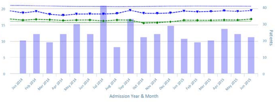
Chart data is indicative status only - © Royal College of Physicians - Technology by Crown Informatics (ID: BPT2)

🔲 Care meets BPT % 🛛 …… ALL NHFD Care meets BPT % 🔷 Surgery <36 Hours % 🛥 OG Assessment <72 Hrs % 🛹 Bone assessment % - Pre-Op AMTS % . + Falls Assessment %