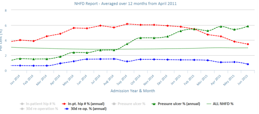
Chart data is indicative status only - www.nhfd.co.uk ® Royal College of Physicians - Technology by Crown Informatics