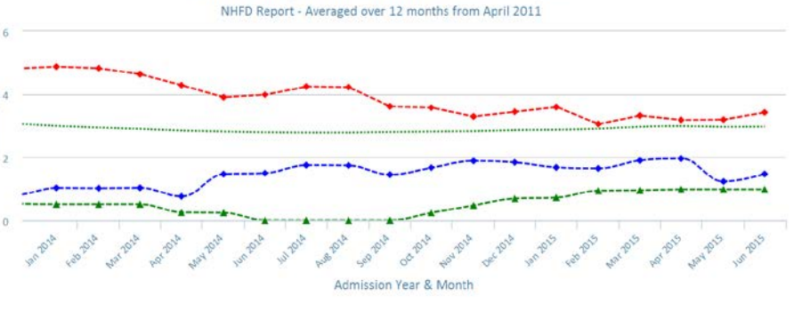
Chart data is indicative status only - www.nhfd.co.uk 🕲 Royal College of Physicians - Technology by Crown Informatics

Patient Safety - MPH. Taunton & Somerset Hospital