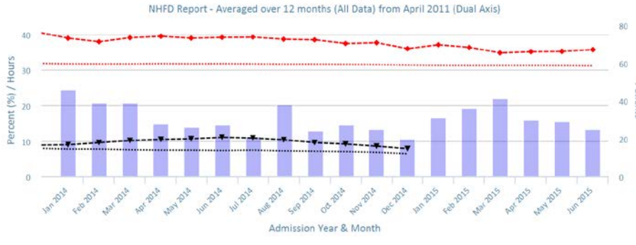
Chart data is indicative status only - www.nhfd.co.uk ($) Royal College of Physicians - Technology by Crown Informatics

---- ALL NHFD ---- 30d mortality % ---- 30d mortality % (annual)