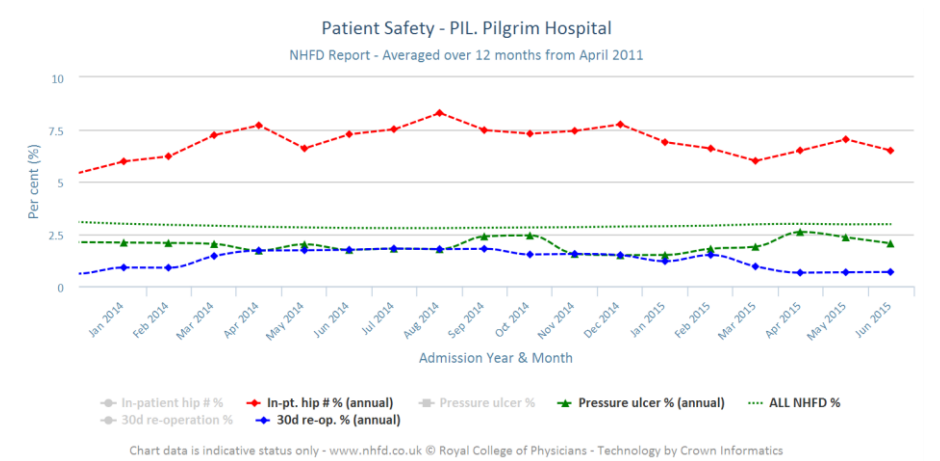
Chart data is indicative status only - www.nhfd.co.uk ® Royal College of Physicians - Technology by Crown Informatics