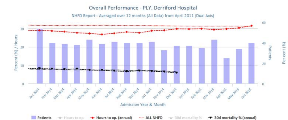
Chart data is indicative status only - www.nhfd.co.uk ($) Royal College of Physicians - Technology by Crown Informatics