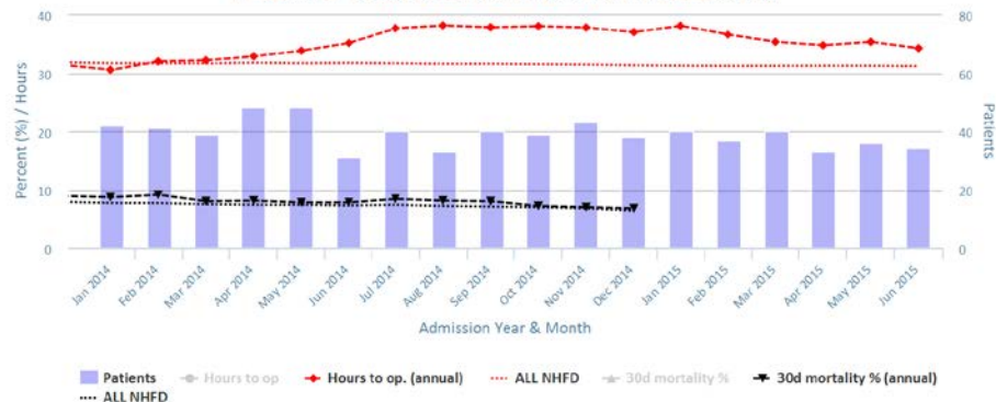
Chart data is indicative status only - www.nhfd.co.uk © Royal College of Physicians - Technology by Crown Informatics

NHFD Report - Averaged over 12 months (All Data) from April 2011 (Dual Axis)