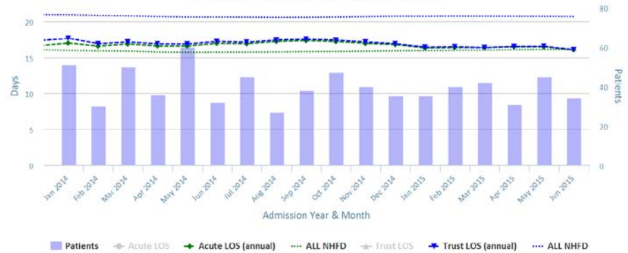
Chart data is indicative status only - www.nhfd.co.uk © Royal College of Physicians - Technology by Crown Informatics

NHFD Report - Averaged over 12 months from April 2011