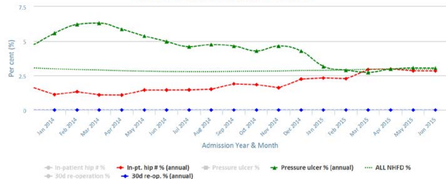
Chart data is indicative status only - www.nhfd.co.uk © Royal College of Physicians - Technology by Crown Informatics

NHFD Report - Averaged over 12 months from April 2011