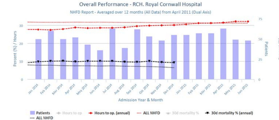
Chart data is indicative status only - www.nhfd.co.uk @ Royal College of Physicians - Technology by Crown Informatics

Patient Safety - RCH. Royal Cornwall Hospital NHFD Report - Averaged over 12 months from April 2011