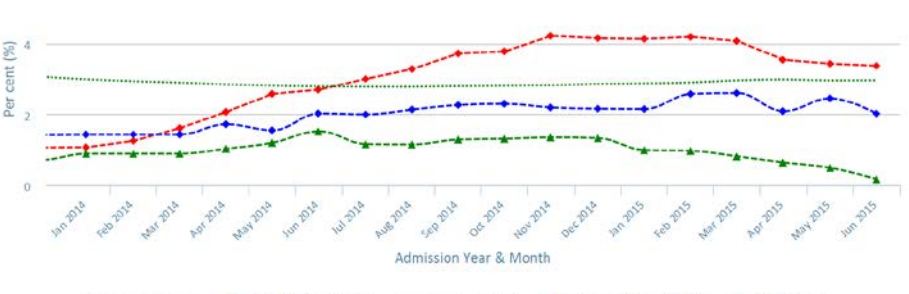
Chart data is indicative status only - www.nhfd.co.uk @ Royal College of Physicians - Technology by Crown Informatics Chart data is indicative status only - www.nhfd.co.uk @ Royal College of Physicians - Technology by Crown Informatics

Patient Safety - RDE. Royal Devon & Exeter Hospital NHFD Report - Averaged over 12 months from April 2011