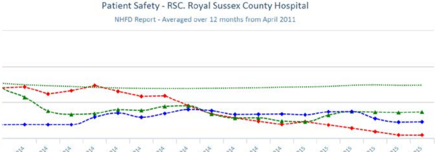
Chart data is indicative status only - www.nhfd.co.uk @ Royal College of Physicians - Technology by Crown Informatics

Patients 🔶 Hours to op. 🔶 Hours to op. (annual) 🚥 ALL NHFD 😓 30d mortality % 🖛 30d mortality % (annual)