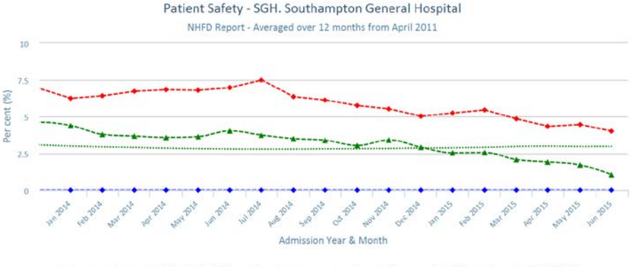
Chart data is indicative status only - www.nhfd.co.uk B Royal College of Physicians - Technology by Crown Informatics

In-patient hip #% In-patient hip #% In-patient hip #% Pressure ulcer % Pressure ulcer % Pressure ulcer % Pressure ulcer % Pressure ulcer % Pressure ulcer % Pressure ulcer % Pressure ulcer % Pressure ulcer % Pressure ulcer % Pressure ulcer % Pressure ulcer % Pressure ulcer % Pressure ulcer % Pressure ulcer % Pressure ulcer % Pressure ulcer % Pressure ulcer % Pressure ulcer % Pressure ulcer % Pressure ulcer % Pressure ulcer % Pressure ulcer % Pressure ulcer % Pressure ulcer % Pressure ulcer % Pressure ulcer % Pressure ulcer % Pressure ulcer % Pressure ulcer % Pressure ulcer % Pressure ulcer % Pressure ulcer % Pressure ulcer % Pressure ulcer % Pressure ulcer % Pressure ulcer % Pressure ulcer % Pressure ulcer % Pressure ulcer % Pressure ulcer % Pressure ulcer % Pressure ulcer % Pressure ulcer % Pressure ulcer % Pressure ulcer % Pressure ulcer % Pressure ulcer % Pressure ulcer % Pressure ulcer % Pressur