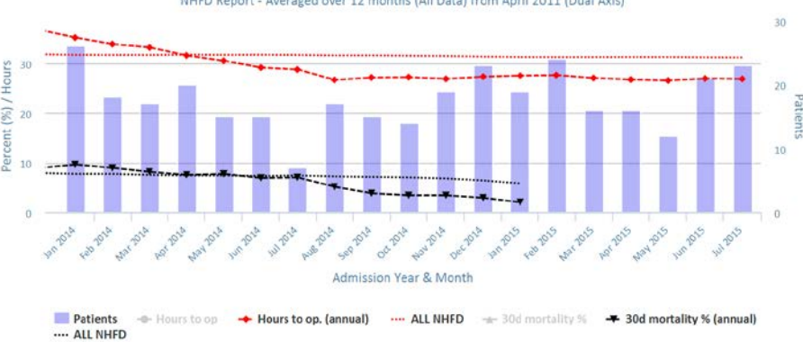
Chart data is indicative status only - www.nhfd.co.uk @ Royal College of Physicians - Technology by Crown Informatics