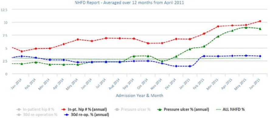
Chart data is indicative status only - www.nhfd.co.uk ® Royal College of Physicians - Technology by Crown Informatics