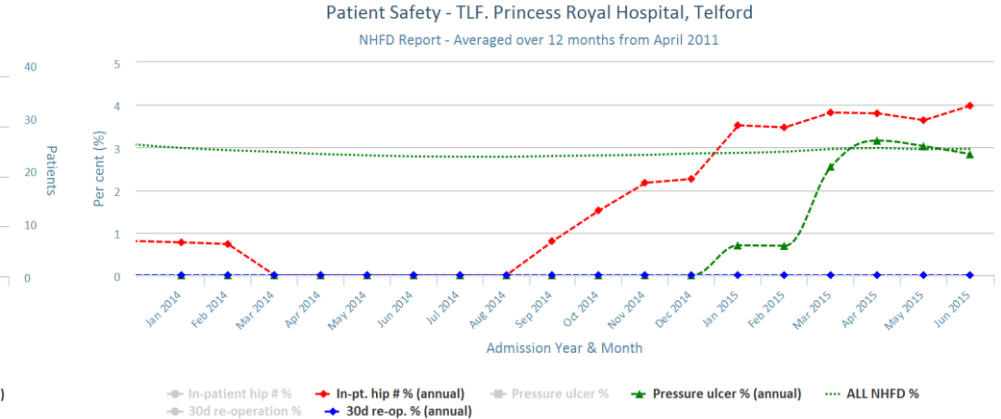
Chart data is indicative status only - www.nhfd.co.uk © Royal College of Physicians - Technology by Crown Informatics