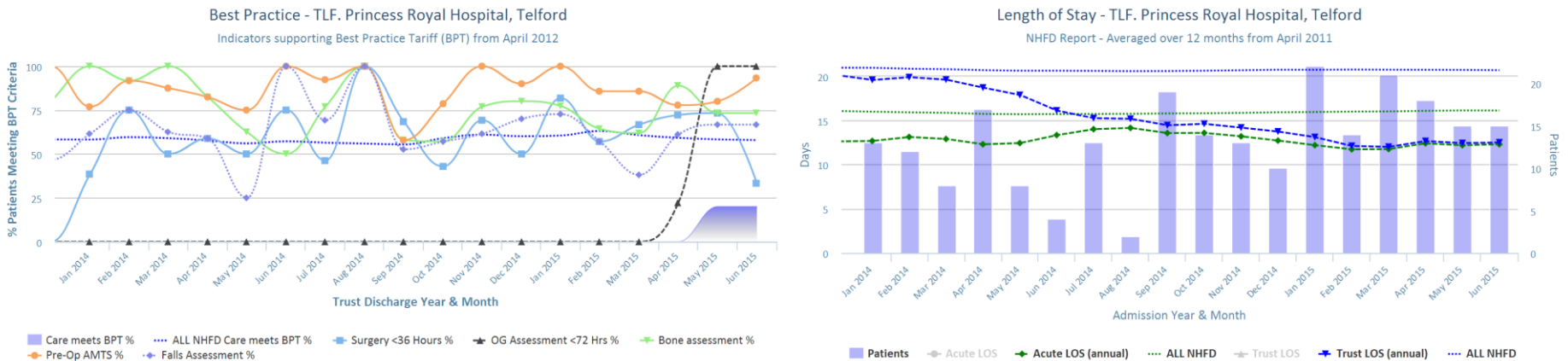
Chart data is indicative status only - © Royal College of Physicians - Technology by Crown Informatics (ID: BPT2)

(Up to date, and interactive versions of all run charts for your hospital can be viewed at www.nhfd.co.uk)