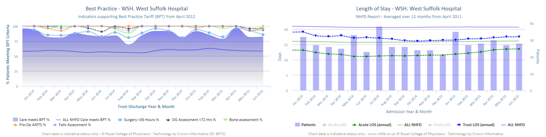
Chart data is indicative status only - © Royal College of Physicians - Technology by Crown Informatics (ID: BPT2)

(Up to date and interactive versions of all run charts for your hospital can be viewed at www.nhfd.co.uk)